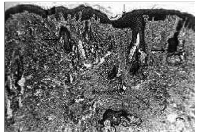
Figure 4. The skin of the left retroauricular area of a 42-year-old man after 14 years' exposure to PCBs. Mild surface hyperkeratosis and signs of acanthotic extension of epidermis, noticeable decline to disappearance of the sebaceous glands, absence of sweat glands, and perifollicular spheric cellulisation (magnification 52x)